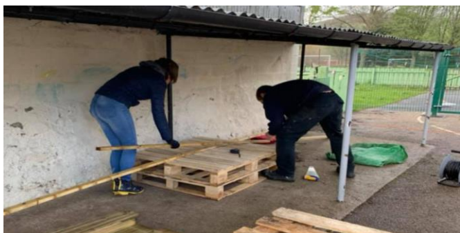
Parent helpers working on playground improvements

"It has been a great community project and brought parents and teachers together as well as improving the playground which will enhance the children's learning. Without the wind farm fund's support and money this would not have been possible, and we are very appreciative."