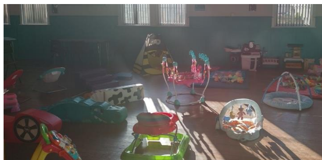
Figure 2. New equipment and Play Mats for new Leswalt Tots and Babies Group.

One of the groups that is now using the Hall is Leswalt Tots, Baby and Toddler Group, which meets every Wednesday for an hour, to 'Play, Learn and Grow Together'. North Rhins Funds supported the group in 2021 with £151 start-up costs to the purchase equipment and play mats.