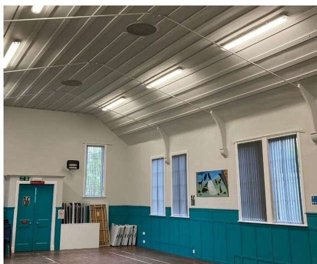
Figure 1. Leswalt Hall: photo shows new windows, door, blinds, LED lights, and paint work.

In April 2019, Leswalt Community Association took on a management agreement for Leswalt Memorial Hall. Between 2019 and 2021 a total of £8,641 has been spent from Greencoat North Rhins funds on hall improvements for this community asset. This photo shows some of the work that was paid for by this fund: