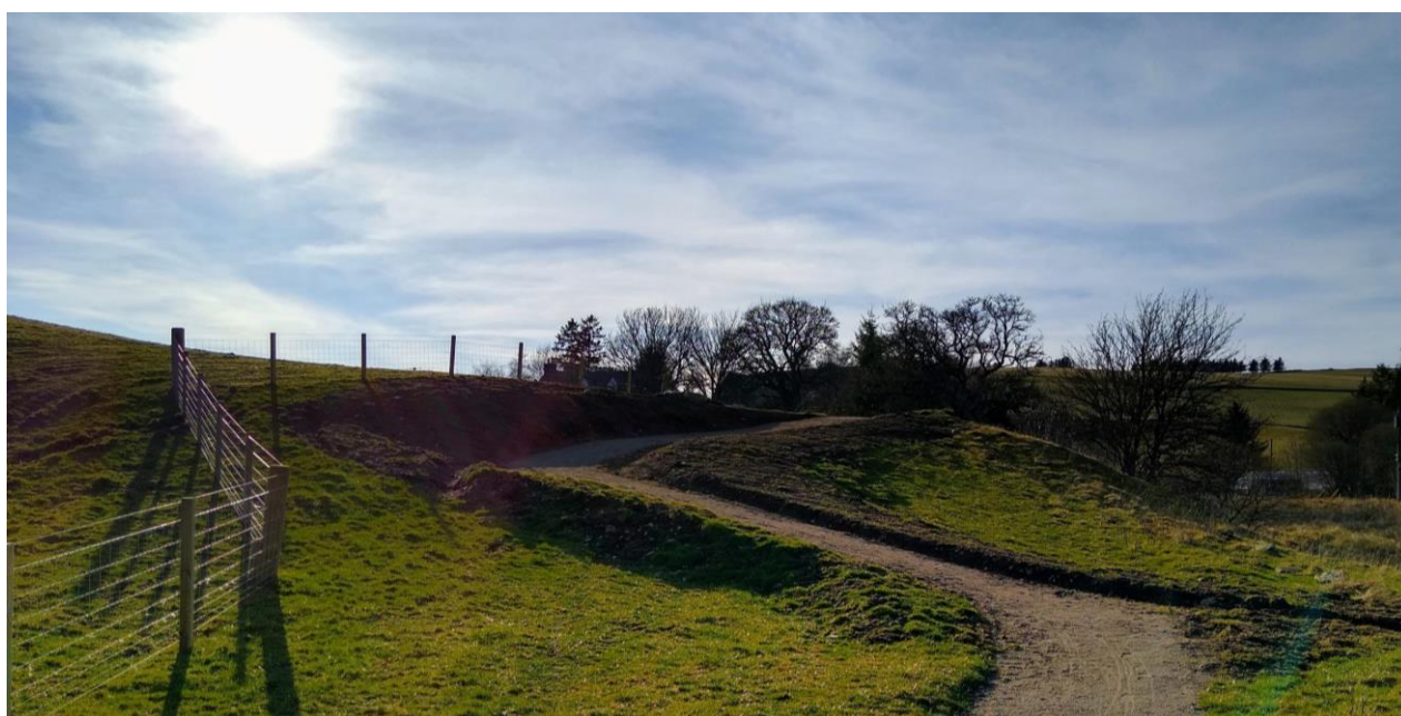
All Ability Nature Trail