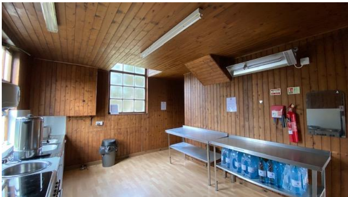
Photo: Kitchen before refurbishment

'Everything was delayed, and we could not begin any work as lockdown and then the escalating cost of materials and lack of contractors meant we could not carry out our original plans. We were worried that a project of this size would be too much for a voluntary committee but found that our committee had the skills needed. It was certainly important to have a solid finance person to manage the invoices and budget and people who could understand the technical requirements to deliver the project and create a plan that meant we could meet the needs of the community in an affordable and practical way.'