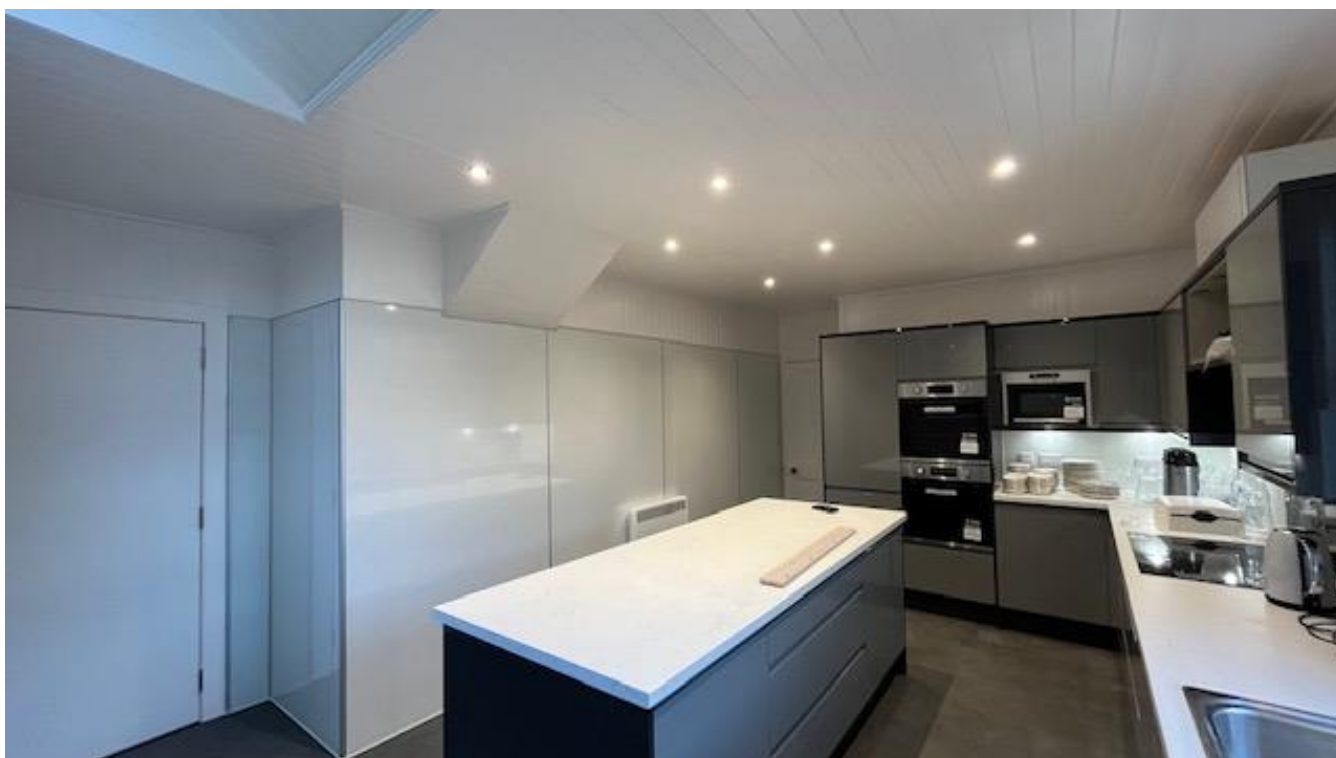
Photo: Kitchen after refurbishment

The Association understood the importance of the hall as a hub for use during emergencies and as the only other public building in the area as the local primary school had closed. To take the hub out of action for an extended period of time was not an option as the community needed access to the hall for a range of activities and events, so the plan was developed to undertake any refurbishment whilst keeping the hall open for use as much as possible.