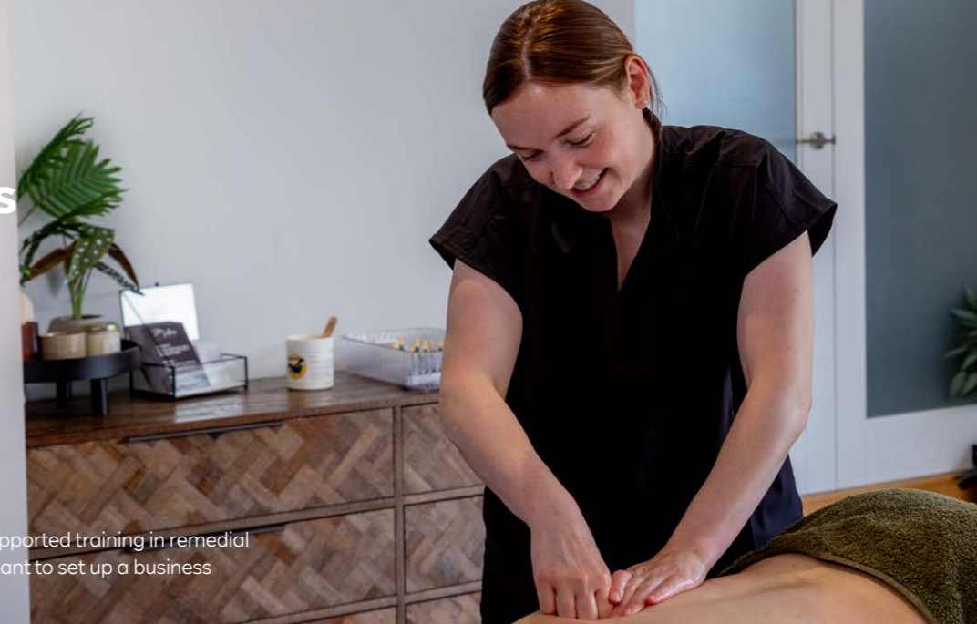
Individual Award Recipient | Funding supported training in remedial and sports massage enabling the applicant to set up a business